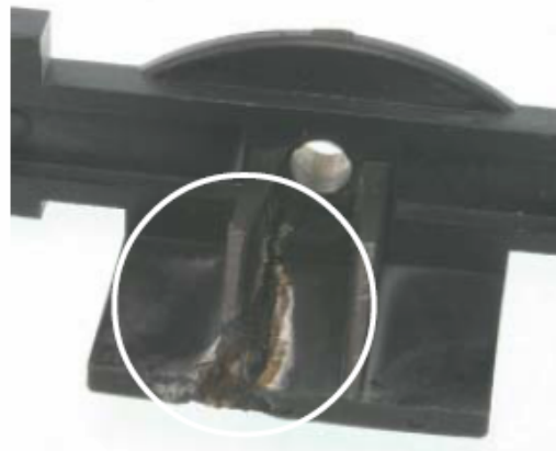
Unacceptable (Developing bearing bar failure)